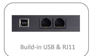
Build-in USB & RJ11